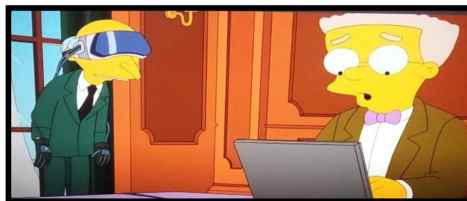
Figure 13 Virtual Glass.